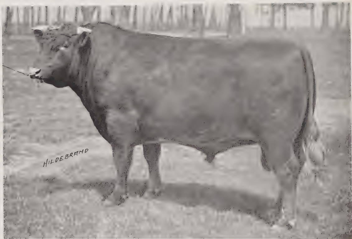
DIAMOND ABBOT 363112.